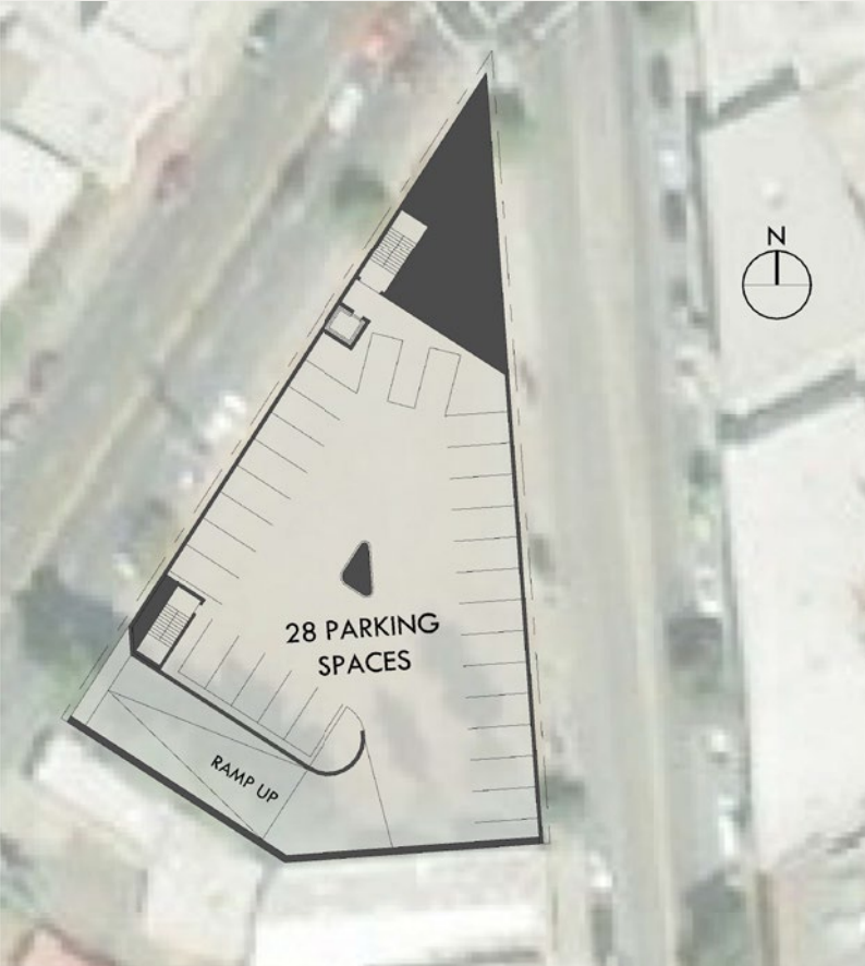
BELOW GRADE PARKING 1/32" = 1'0"