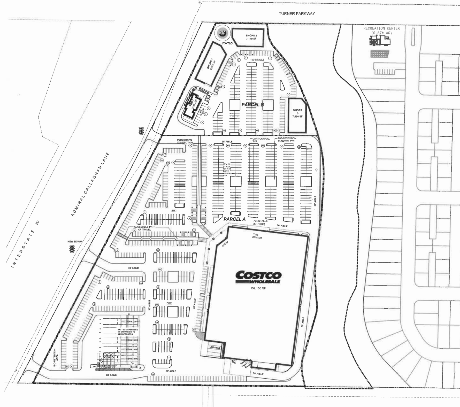
SITE PLAN Scheme A.2